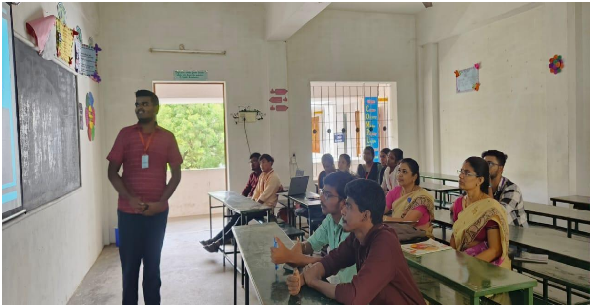
Photo Gallery PAPER PRESENTATION